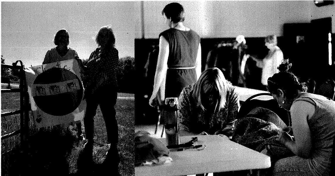
Do What You Can - Climate Fringe Festival event, June 2023 (Strath Halladale)