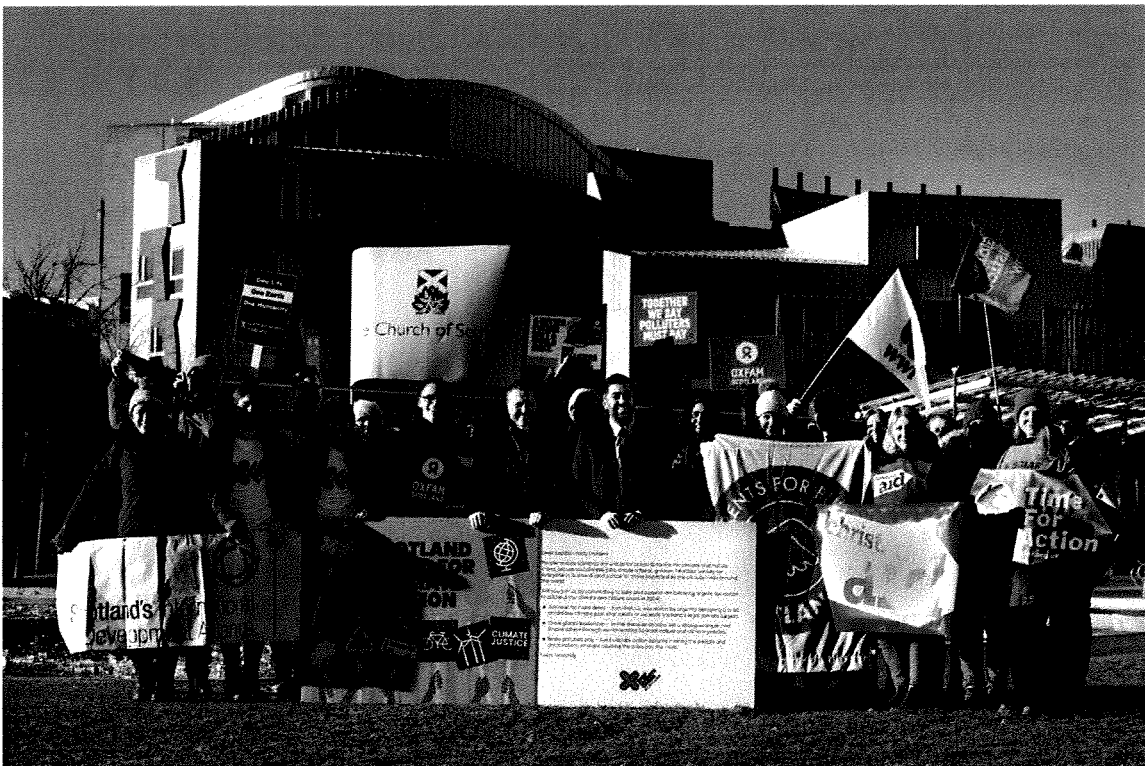
SCCS members at the New's Year's resolution photo stunt with the First Minister, January 2024