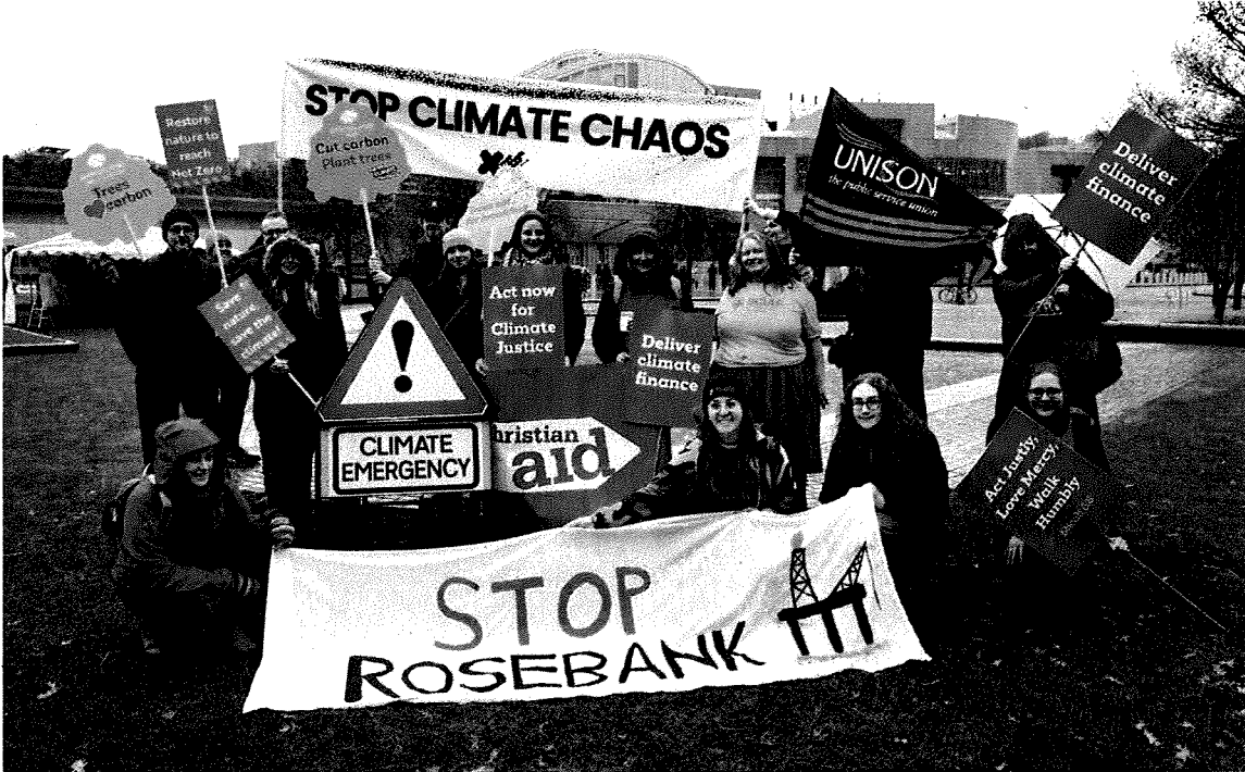
SCCS members at the COP28 Global Day of Action, December 2023

Objectives and Review of Activities (continued)